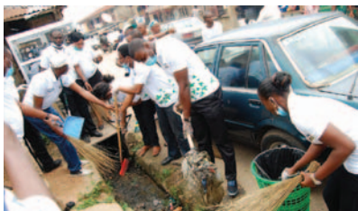
Staff in Osun State participate in the C2G activation with the host community