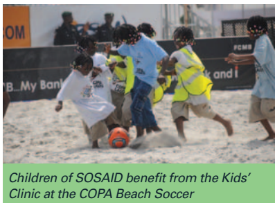
Children of SOSAID benefit from the Kids' Clinic at the COPA Beach Soccer