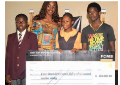
Winners of the 'Survival of Nigerian Child' painting competition with Nollywood Star, Kate Henshaw-Nutal

The 'Priceless Gift of Sight' is essentially a charitable gift, however it strongly reflects the three focal areas of our CSR. For those who cannot see, going about their normal course of duty becomes an ordeal; they become dependent on others which invariably affects the economy and contributes to extreme poverty, many even