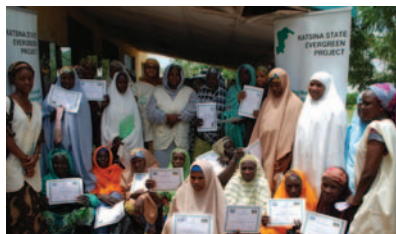
Successful participants in the Evergreen Skills Acquisition exercise in Katsina State