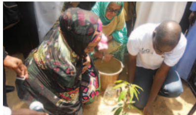
The First Lady of Katsina State plants the first tree at the Evergreen flag off