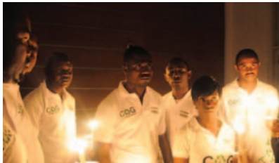
The FCMB community gathers at the First City Plaza for the Earth Hour switch-off