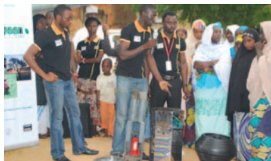
Students In Free Enterprise (SIFE) showcase the Save80 Stove as a mitigant to Climate Change and Environmental Degradation